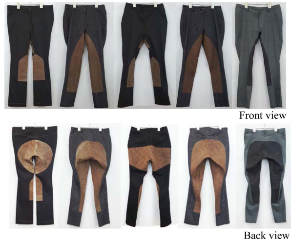
Photo 2. Design development and productions.

generated by irritating knee by sewing line due to slim margin between patch part, which is inside reinforcement plate, and outside plate, irritation of knee by slim margin of cutting line can be avoided if cutting line of patch part shall be composed of diagonal line from crotch to the middle of front knee. It can reduce irritation to skin by processing slim margin toward outside with flat fell seam instead of simple over lock process or doing stitching one more time by pushing slim margin to the maximum. Second, since lower