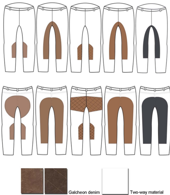
Fig. 1. Flat sketch of design development and productions (back view).

tacting the skin and have attempted to reduce weight by selecting light materials for padding materials.