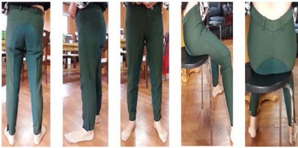
Photo 1. Buckle type locking equipments of horseback riding pants design.

sewing line and two kinds of designs on parts of hip and knee for experiment horseback riding pants manufactured in this study.